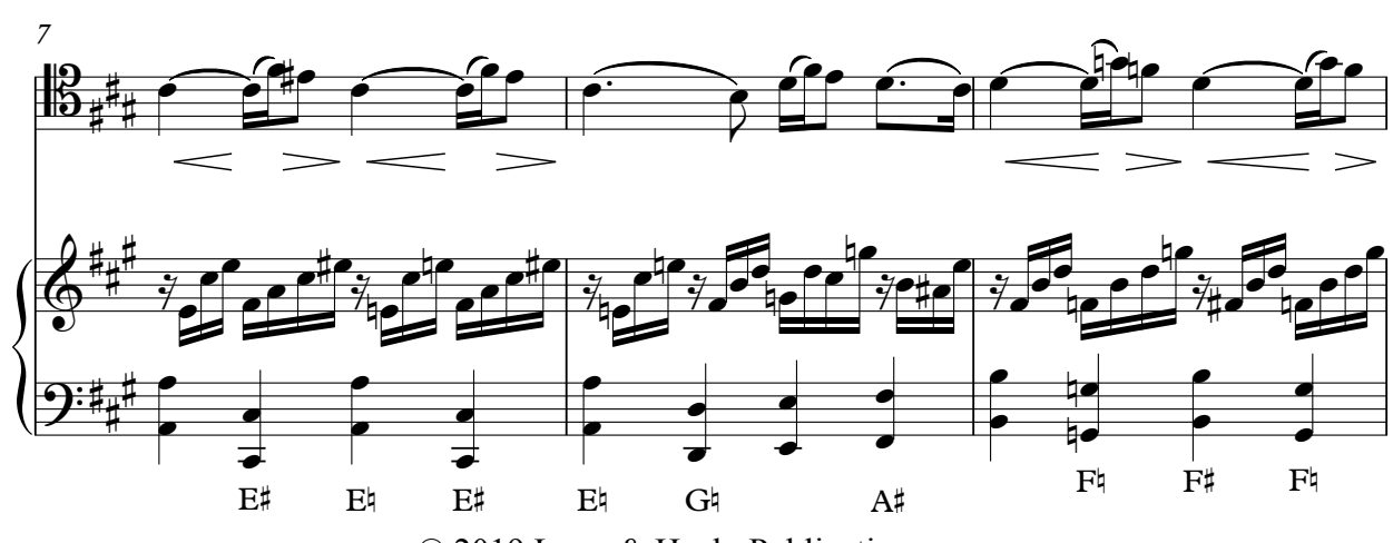
\ @ 2019 Lyon & Healy Publications